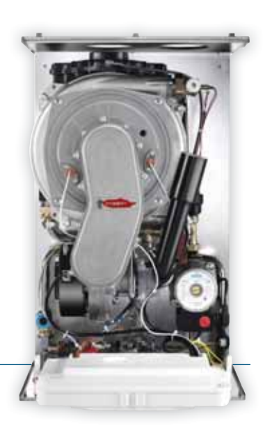
NATURAL GAS & PROPANE